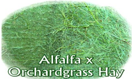
Alfalfa x Orchardgrass Hay

HAY FOR SALE 5X6 ROUND BALES 1000 LBS-$80.00 EACH SMALL SQUARE BALES 60-70 LBS $6.00 - $7.00 EACH PLEASE CALL 250-256-7560