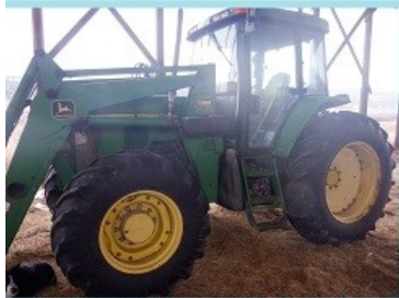
JD 7200 MFWD w/LOADER

Kamloops Stockyards 2 Day Timed Online Sale!