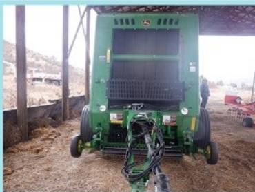
JD 460M BALER

For more information please visit our website www.bclivestock.bc.ca or call any one of our team!